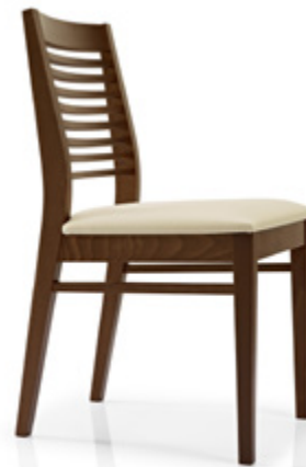
1656 Side Chair