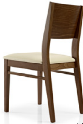
1654 Side Chair