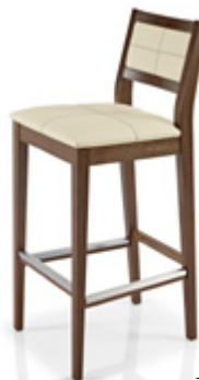
1662 Bar Stool