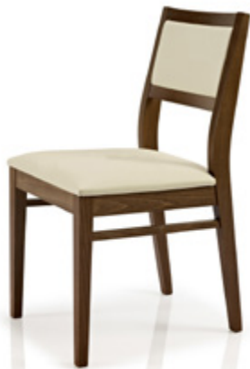
1655 Side Chair