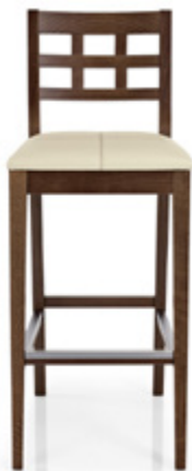
1659 Bar Stool