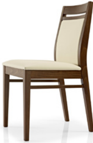
1651 Side Chair