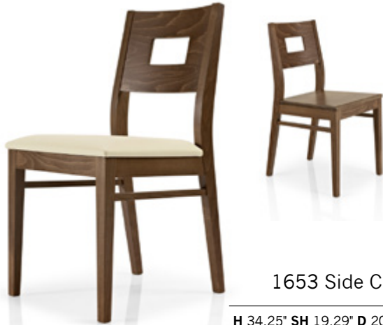
1653 Side Chair