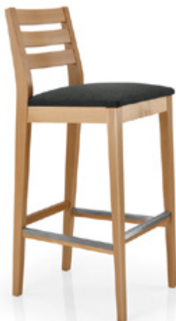
1657 Bar Stool