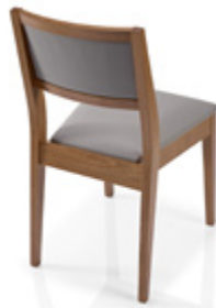
1667 Side Chair