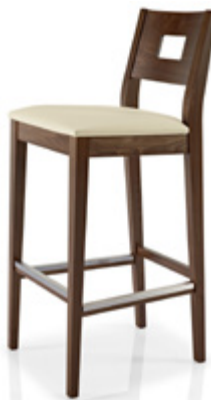
1660 Bar Stool