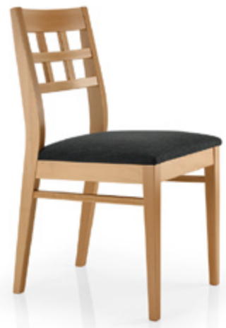
1652 Side Chair