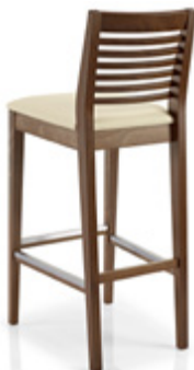
1663 Bar Stool