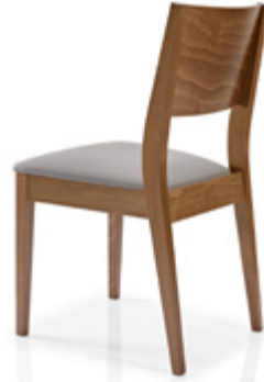
1666 Side Chair

H 34.25" SH 19.29" D 22.83" W 22.05" AH 26.38"