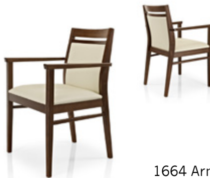
1664 Arm Chair

H 34.25" SH 19.29" D 22.83" W 22.05" AH 26.38"