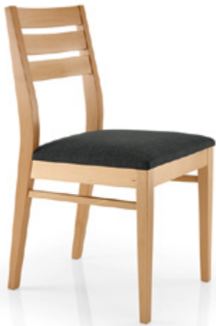
1650 Side Chair