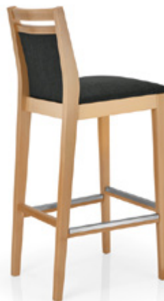
1658 Bar Stool