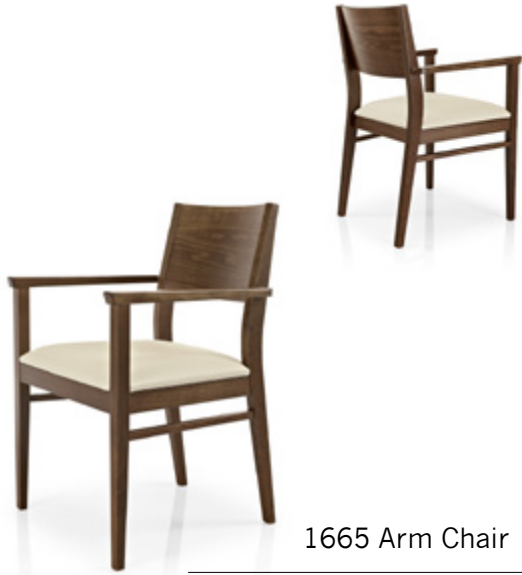
1665 Arm Chair

H 34.25" SH 19.29" D 22.83" W 22.05" AH 26.38"