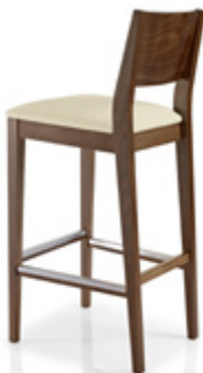
1661 Bar Stool