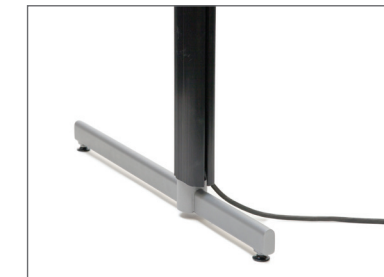
Optional vertical wire management.