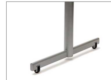
90-20 Optional concealed Castor (T-base).