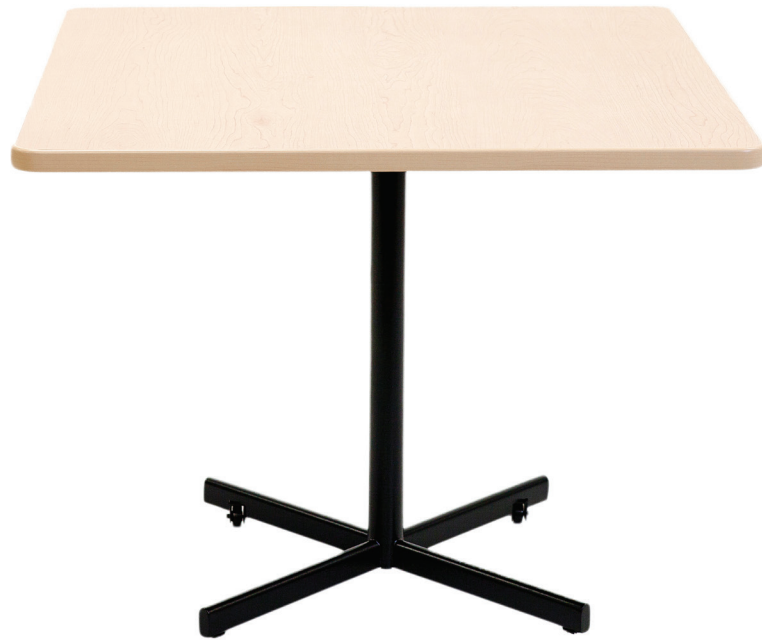
BATALI 90-4-28 Included 90-24 Concealed Caster