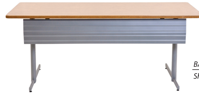
BATALI 90-2-28-MOD Cantilever Shown With Optional Embossed Modesty Panel.