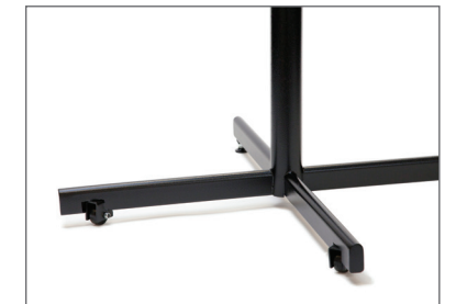
90-24 Optional concealed castor (X-base).