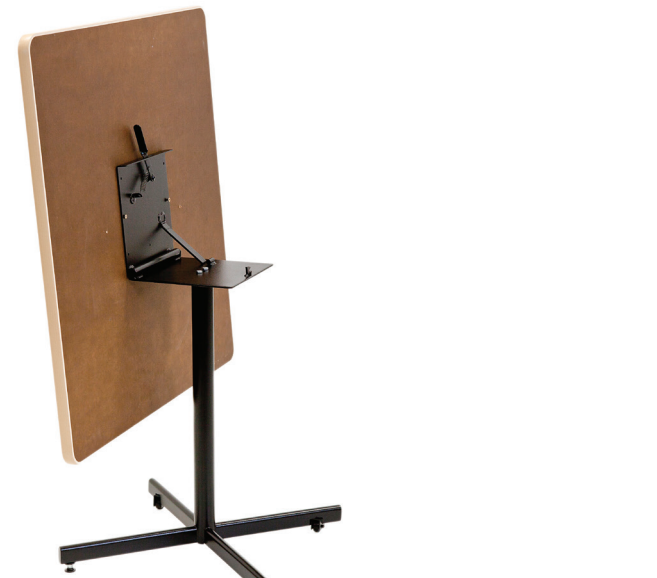
BATALI 90-4FT-28 Optional formed metal flip top mechanism with positive locking safety feature.